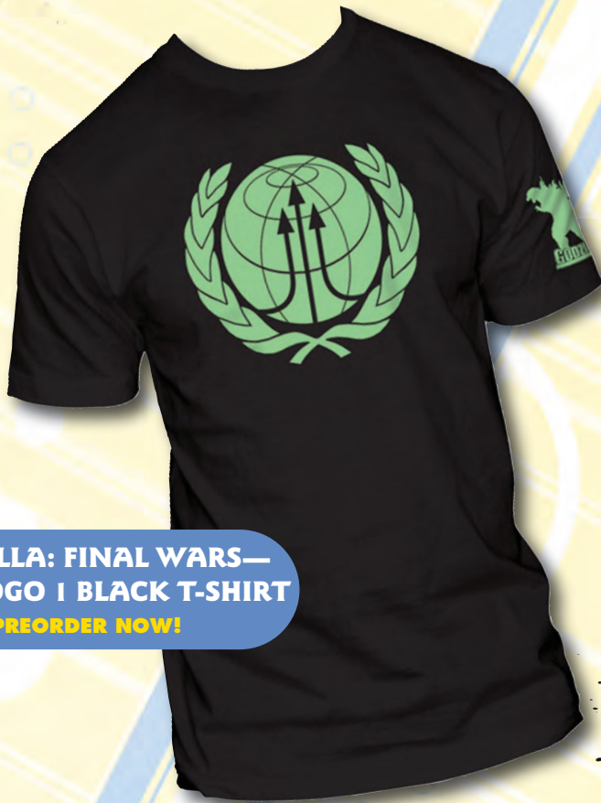
GODZILLA: FINAL WARS— E.D.F. LOGO | BLACK T-SHIRT PREORDER NOW!