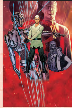
STAR WARS: AGENT OF THE EMPIRE— IRON ECLIPSE #1 DARK HORSE COMICS