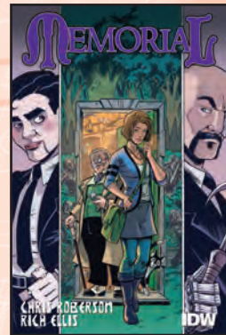
MEMORIAL #1 IDW PUBLISHING