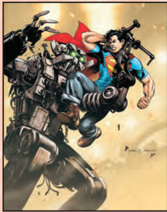
ACTION COMICS #4 DC COMICS