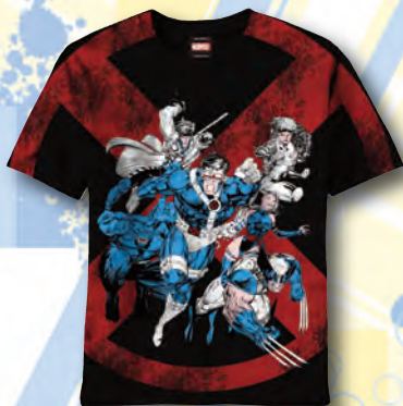
X-MEN: "6 EXES" BLACK T-SHIRT PREORDER NOW!

Available only from your local comic shop!