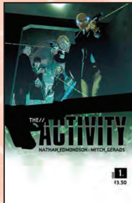
THE ACTIVITY #1 IMAGE COMICS