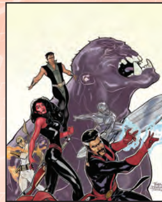
DEFENDERS #1 MARVEL COMICS