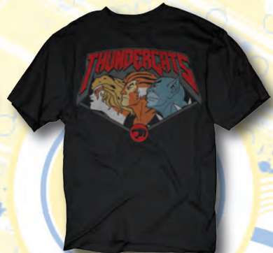
THUNDERCATS: "LOOK ONE WAY" BLACK T-SHIRT PREORDER NOW!

SEE THE PREVIEWS EXCLUSIVE APPAREL SECTION IN PREVIEWS!