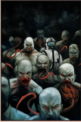
THE STRAIN #1 DARK HORSE COMICS