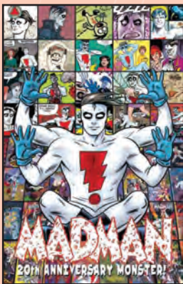
MADMAN 20TH ANNIVERSARY MONSTER! HC IMAGE COMICS