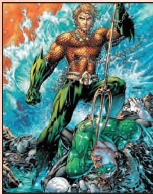
JUSTICE LEAGUE #4 DC COMICS