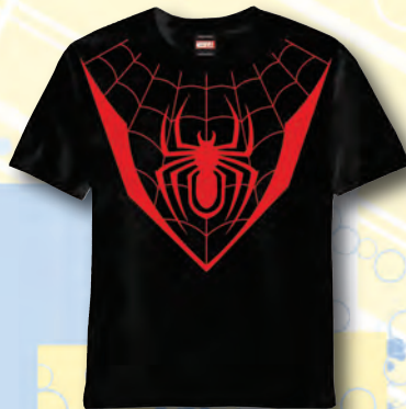
SPIDER-MAN: "FALLOUT 4" BLACK T-SHIRT PREORDER NOW!